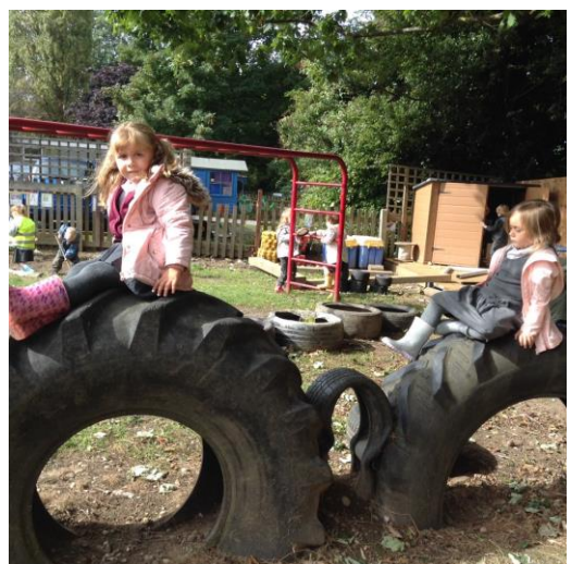
Reception enjoying learning outside.