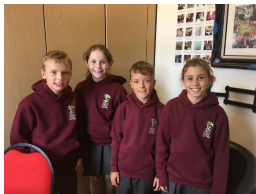
Our new Year 6 Captains in their 'Captain' hoodies.

Yr 6: Height & Weight Letter All: (e-mail) Crossing Patrol Vacancies Yr4: (e-mail) Tri Golf Yr5: (e-mail) Fun Run