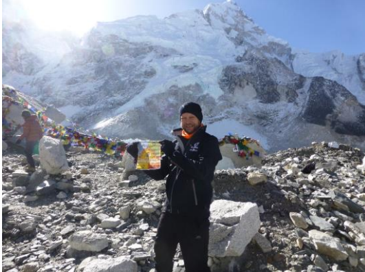
Our winning prayer flag placed at Base Camp, Everest on 24 th April at 3.17am UK time.