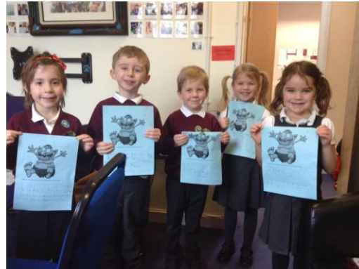
Fantastic writing from Reception!